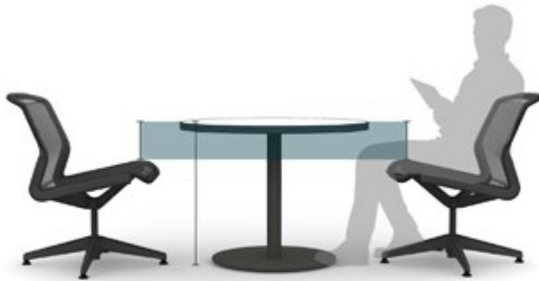
Table Height: 26" Clearance: 8.5" – 10"