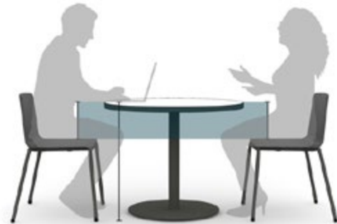
Table Height: 28" – 29.75" Clearance: 10" – 11"