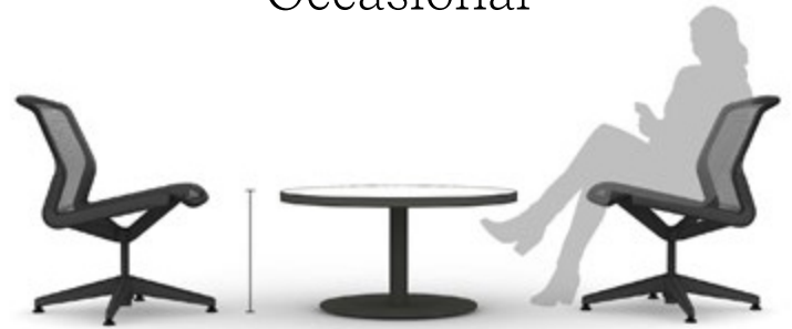
Table Height: 16" – 18" Clearance Not Applicable