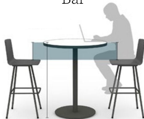
Table Height: 41" – 42" Clearance: 10" – 12"