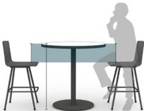
Table Height: 36" – 37.6" Clearance: 10" – 12"