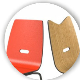
2 design options in back profile