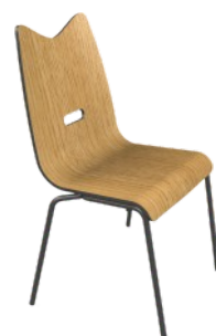
Natural finish (Veneer/Laminate) with M Cut