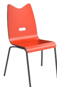
Solid finish (Laminate) with M Cut