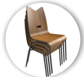
Stackable easy to store