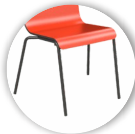
19dia MS Tube understructure